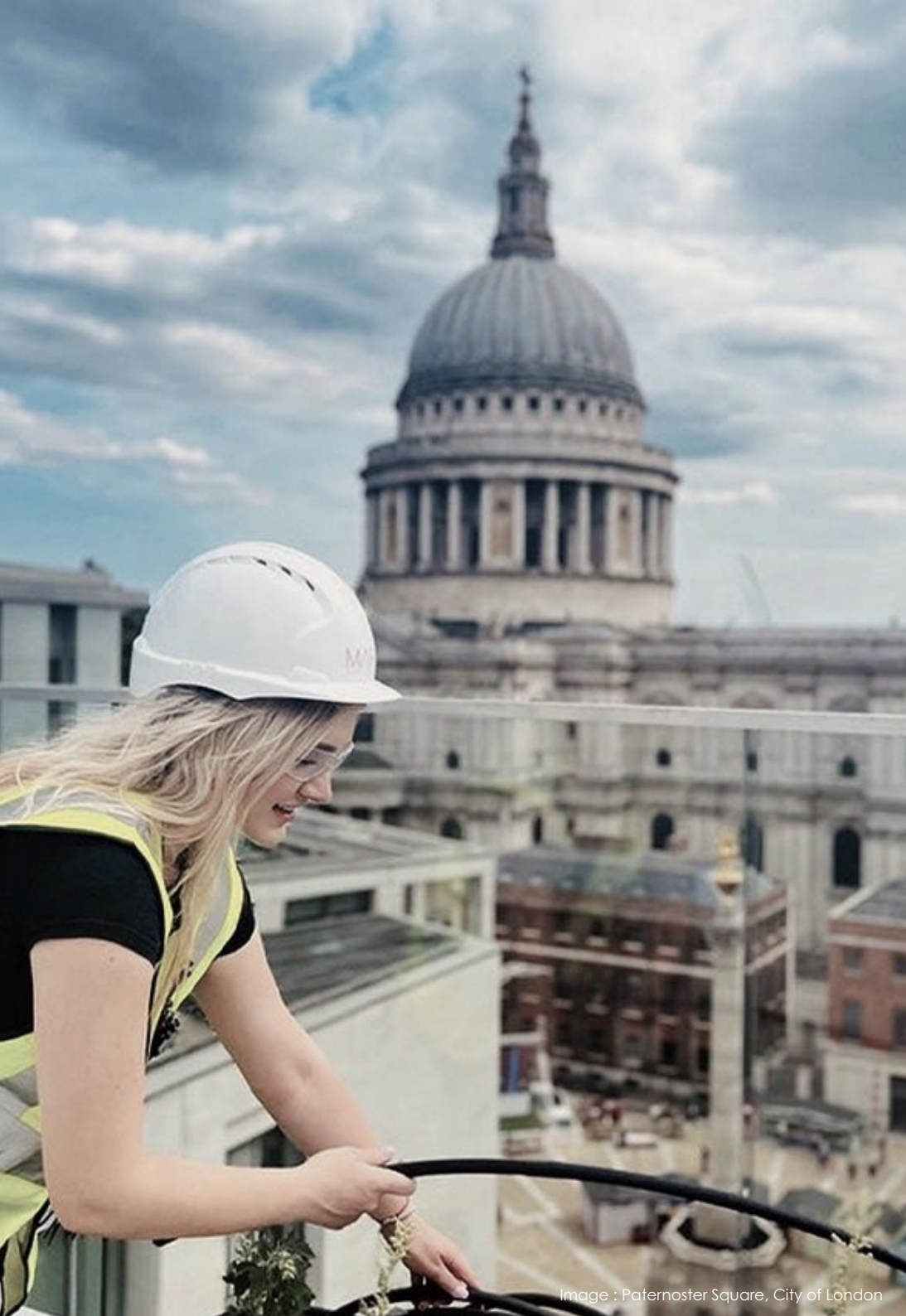
Image : Paternoster Square, City of London